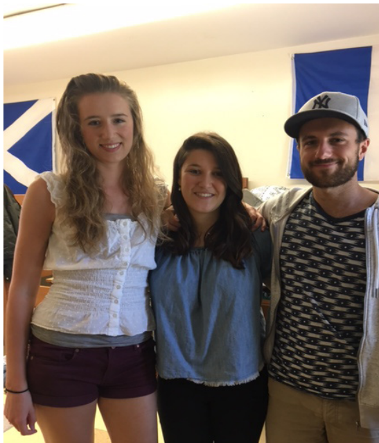
Residents of the Rotary International House on the UA Campus. This was taken last Tuesday, May 2nd, 2017.

Members also heard an update on the UA's Roteract Club, which is showing signs of great success.